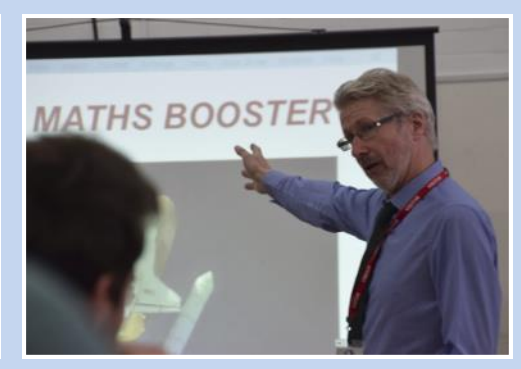
66 The maths was really difficult and challenging but working together with other students really helped me smash it!