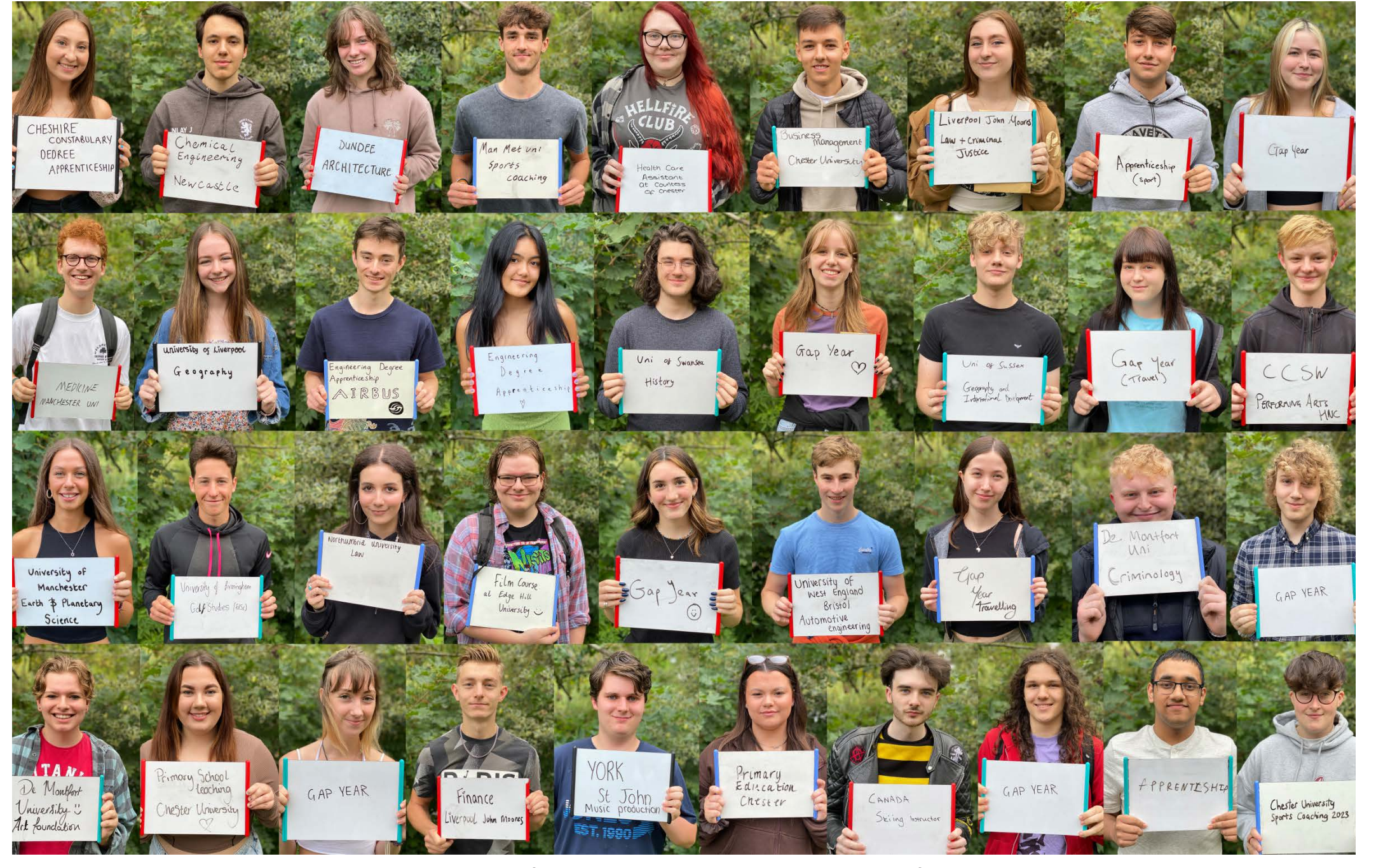
All students who applied to university were successful in securing a place, with over 23% of students going on to study a STEM subject.