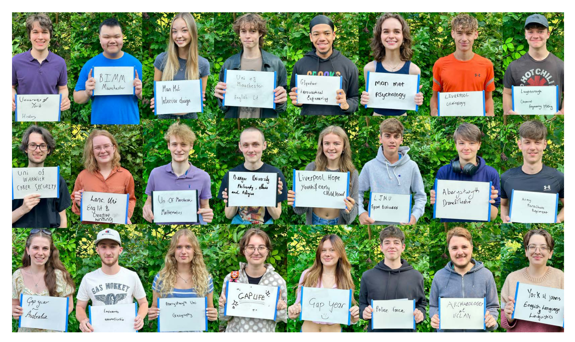
In 2023, all students who applied to university were successful in securing a place, with over 35% of students going on to study a STEM subject at leading universities.

During their time in the Sixth Form, students will have access to a pastoral programme which supports students with decisions about, and applications to university and higher level apprenticeships. Through our PSHE and Citizenship programme, students work closely with local and Russell Group Universities to develop their understanding of how to make successful applications to competitive courses.